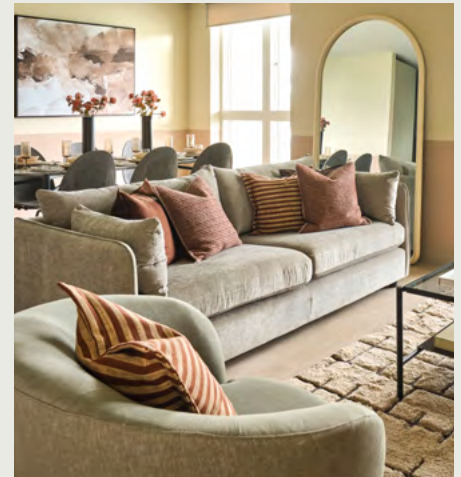
SOFA AND COFFEE TABLE