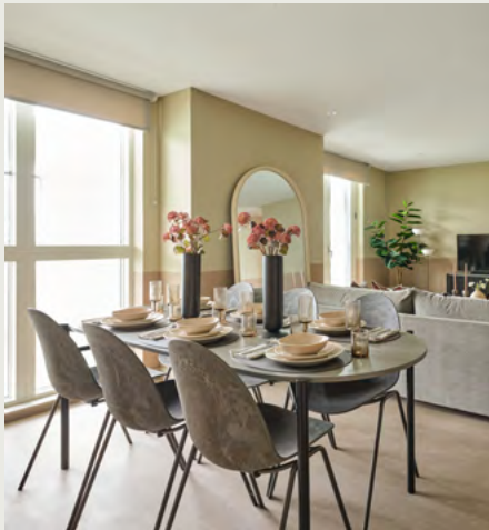
DINING TABLE AND CHAIRS

Our interior designers have curated a premium – quality furniture package including bespoke pieces all set up and ready for when you move in. Prefer to bring your own? Speak to a member of our team to see if we have any unfurnished options still available.