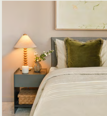
KING SIZED BED AND BEDSIDE TABLE